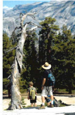
5th grade student and chaperone in Yosemite

The Class Fund also provides students with every instrument they need for their musical journey across the grades.